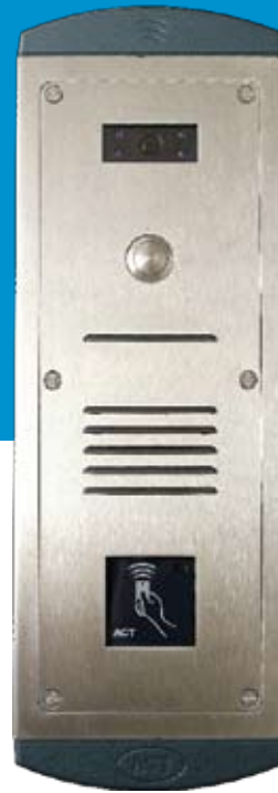
Door Entry Panel