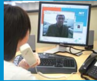
PC Handset & Application Software