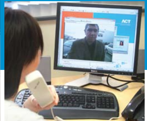
PC Handset & Application Software