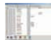
ACTWin Smart Software

Prox & mag stripe with max read range of 10cm. Suitable for ID printing.